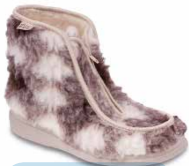
27 Model: 996D009