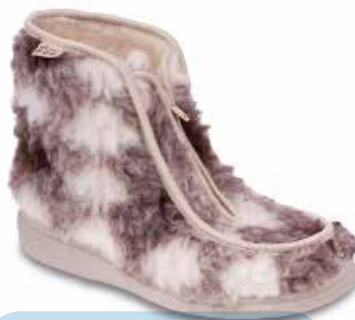
44 Model: 996M009