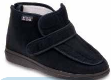
45 Model: 987M002