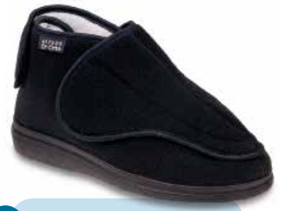
42 Model: 163M002