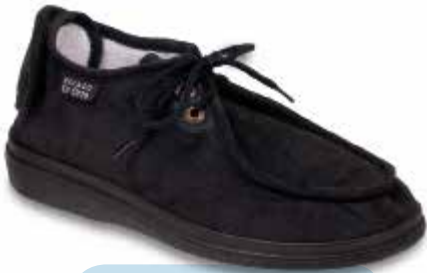
15 Model: 387D005