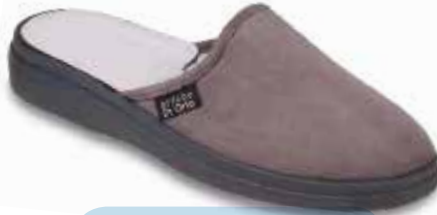
2 Model: 132D010