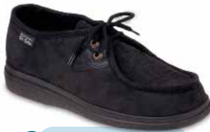
16 Model: 871D004