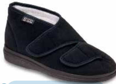
41 Model: 986M003