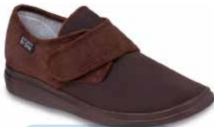
14 Model: 036D008