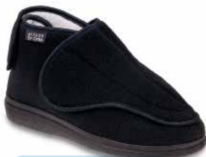
25 Model: 163D002