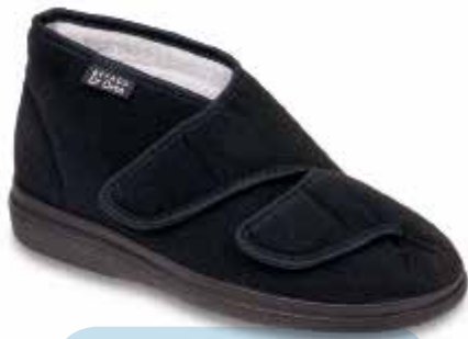
23 Model: 986D003