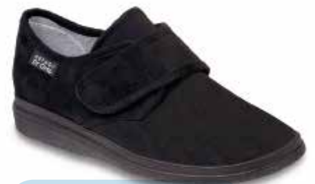
13 Model: 036D007