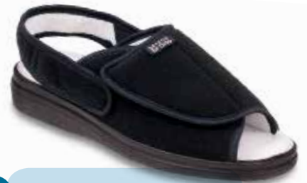
39 Model: 983M004