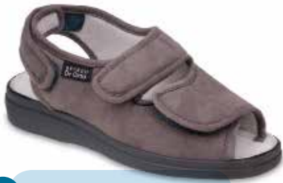
37 Model: 733M006