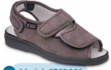
20 Model: 676D006