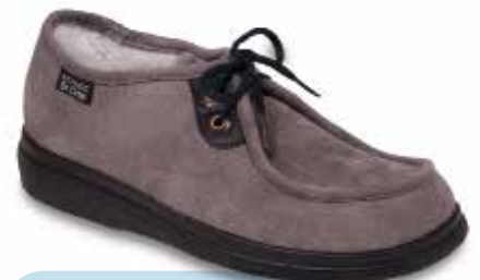
35 Model: 871M006