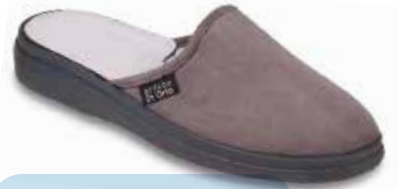
30 Model: 125M009