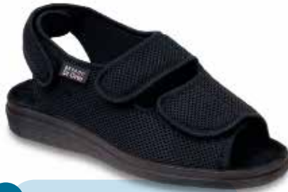
38 Model: 733M007