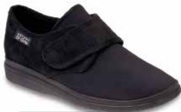
31 Model: 131M003

Size: 42-48 Width fitting: adjustable E W+