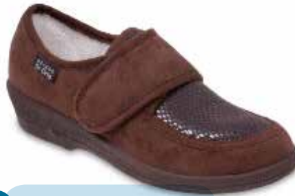
9 Model: 984D010