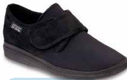
12 Model: 036D006