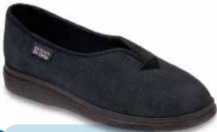
4 Model: 057D028