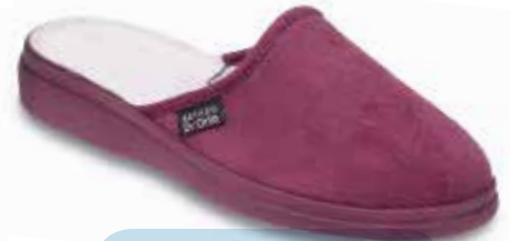
3 Model: 132D011