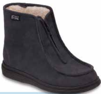
43 Model: 996M008