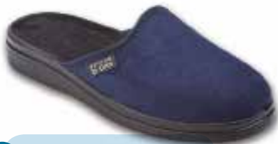
28 Model: 125M006