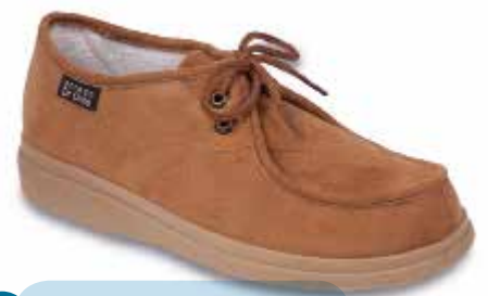
17 Model: 871D005