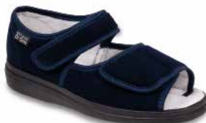
21 Model: 989D002

W+ Removable preventive insole for adjustment of width fitting and better hygiene.