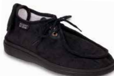
36 Model: 732M004

W+ Removable preventive insole for adjustment of width fitting and better hygiene.