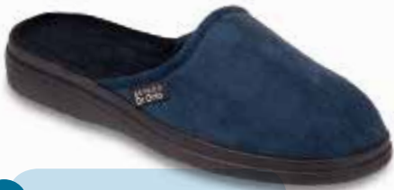
1 Model: 132D006