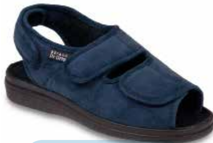
18 Model: 676D003