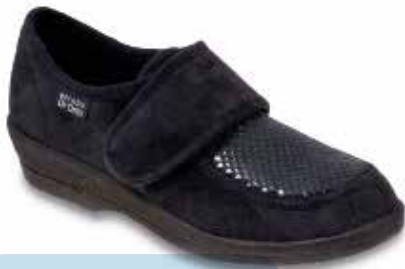
8 Model: 984D012