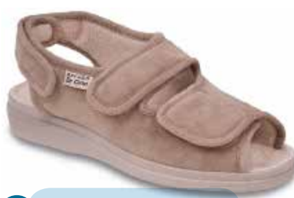
19 Model: 676D004