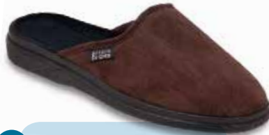
29 Model: 125M008