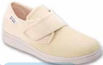
11 Model: 036D005