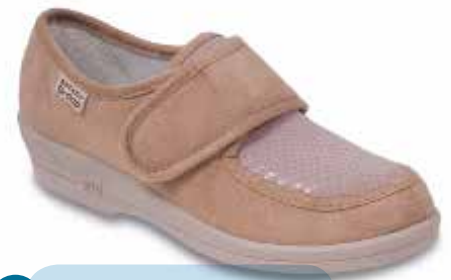
10 Model: 984D011