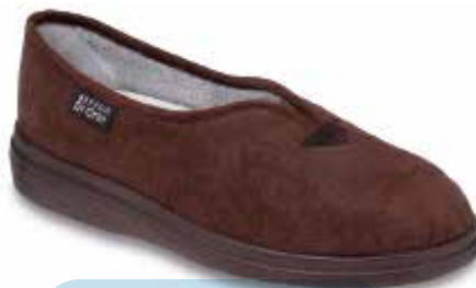
5 Model: 057D026