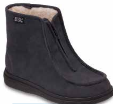
26 Model: 996D008