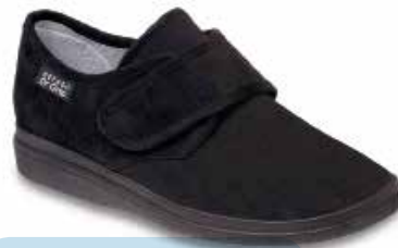
32 Model: 131M004

Size: 42-48 Width fitting: adjustable E W+