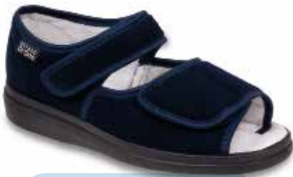
40 Model: 989M002