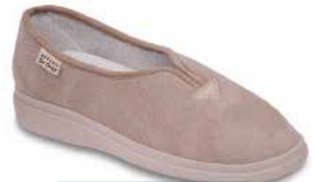
6 Model: 057D027