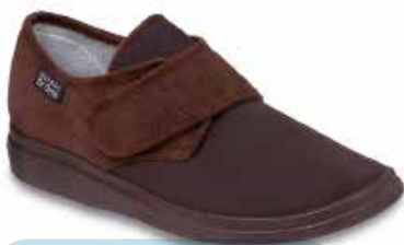
33 Model: 131M005

Size: 42-48 Width fitting: adjustable Ag E W+