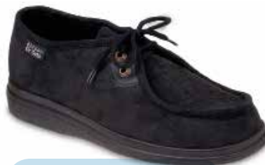
34 Model: 871M004

Size: 42-48 Width fitting: adjustable Ag E W+